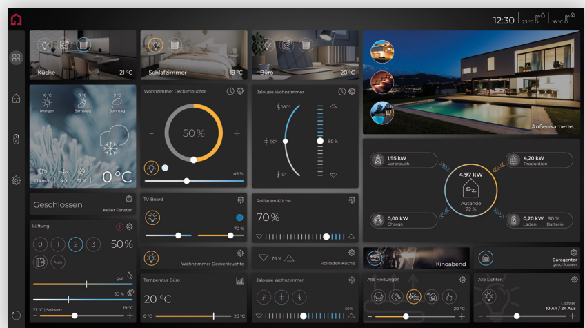
YOUVI – Controlpro